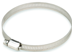
Round Member Adapter for 5–6 in round members