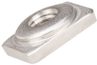
Universal Angle Adapter Insert