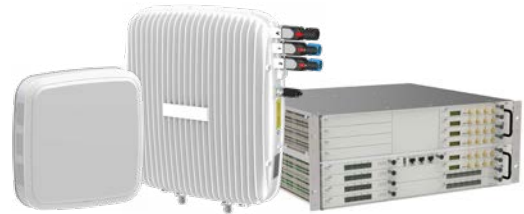
ERA head-end node and access points

AIMOS provides automated support with robust fault, configuration and inventory management capabilities, saving time and money for otherwise manual tasks. It integrates with third-party systems that use SNMP and data interchange formats such as SOAP and XML. AIMOS is available via software license or software as a service (SaaS).